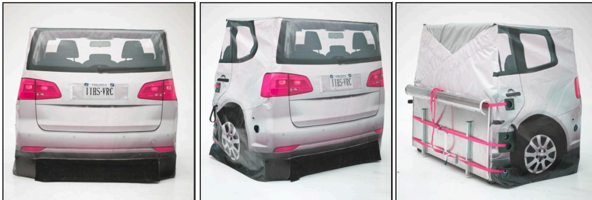
Figure 2 ADAC Advanced Emergency Braking System Stationary Target

The ADAC Advanced Emergency Braking System (AEBS), which is produced by Messring Systembau GmbH, is used as the stationary target ( http://www.messring.de/test-facilities-and-components/adac/ ). The stationary carriage and balloon car are shown in Figure 2. The balloon car is equipped with a U.S.-specific license plate. At the beginning of testing, the target will be inflated to 250 mbar and maintained at that pressure throughout testing. The target cover should also be free of wrinkles during testing.